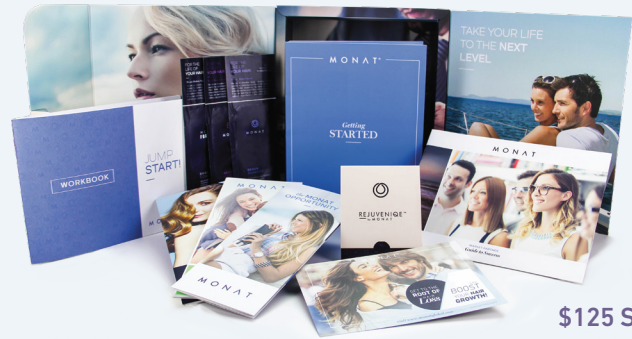
$125 Starter kit